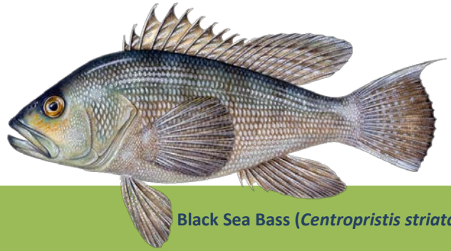
Black Sea Bass ( Centropristis striata )